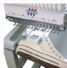
▲Air type Pocket Frame 2 (90mm x 30-258mm)