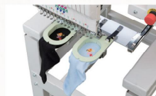
▲Sock Frame (50mm x 30mm)