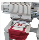
▲Air type Clamp Frame 2 (80mm x 120mm 110mm x 140mm 140mm x 200mm)