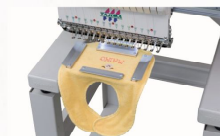
▲M Frame 3 (set of 6 sizes)