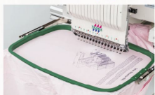
▲Tubular Frame (360mm x 500mm)