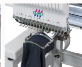
▲Pocket Frame (45mm x 80mm 80mm x 55mm)