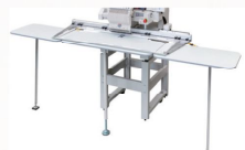
▲X-extension Unit (360mm x 1200mm)