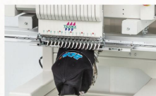
▲Cap Frame 2 (75mm x 360mm)