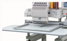
▲Border Frame (360mm x 500mm)